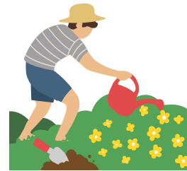
WORKING ON A PROJECT

To channel anxious thoughts or feelings in more productive ways, we might identify specific outlets to express creativity, such as working on a project, drawing, and athletics.